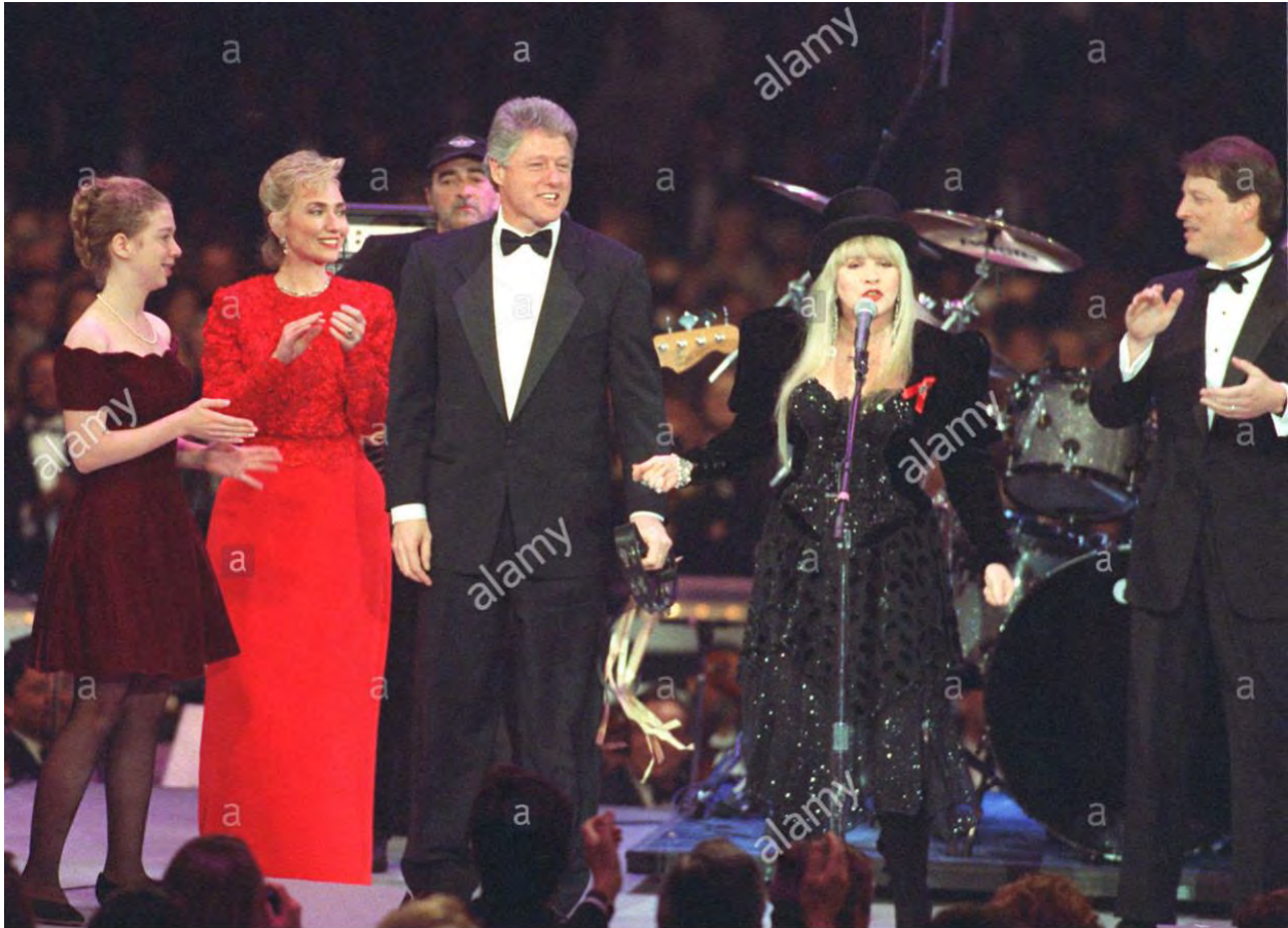
30349JB MG 52TH PRESIDENTIAL INAUGURAL GALA PRESIDENT CLINTON & FAMILY, STEVIE NICKS & AL GORE