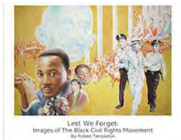
Portrait showcasing the collection Lest We Forget: Images of the Black Civil Rights Movement